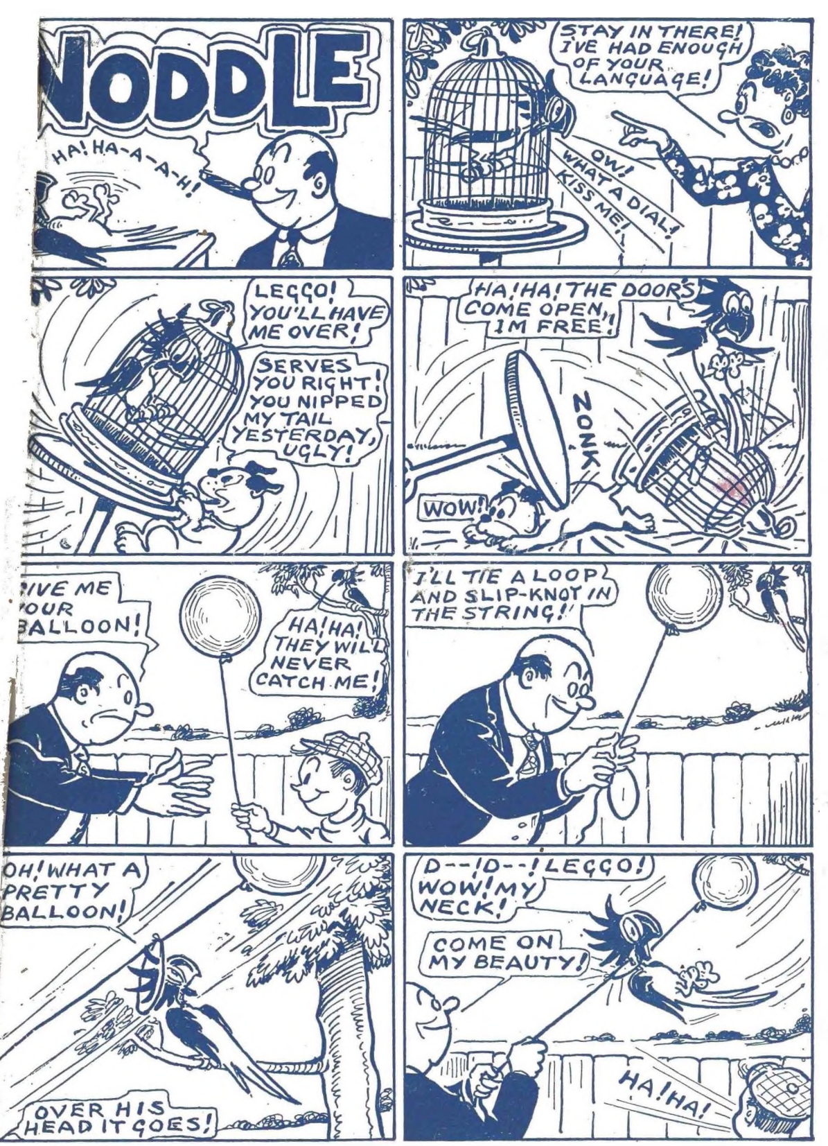
A PAGE FROM ONE OF OUR 'LAUGHITOFF' COMICS—See Advertisement Over